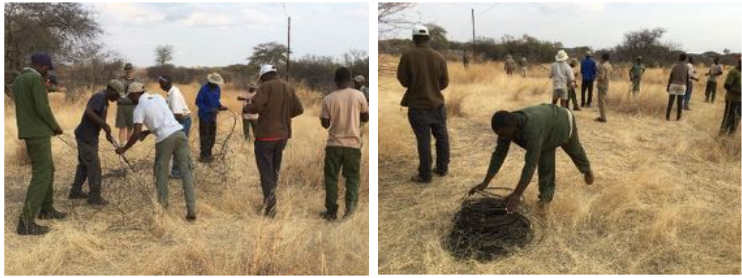
Very grateful to everyone who generously volunteered their time to help to turn tangled wire hazards like this into neat rolls that could finally be removed from the wildlife area.